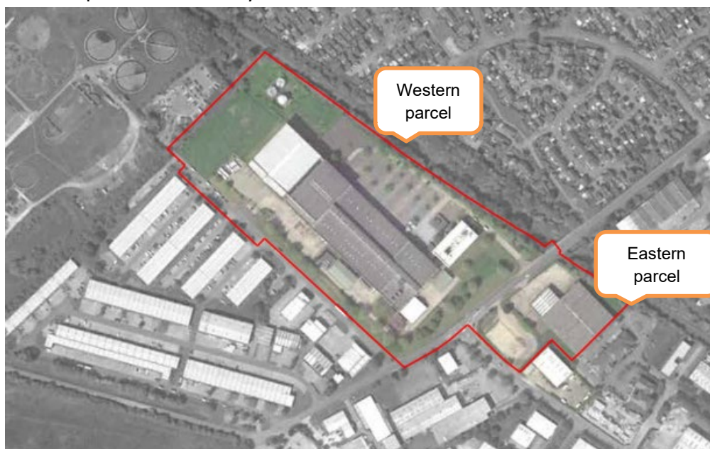
Figure 1.1 – Existing site

6.18 The loss of the existing employment floorspace (c. 22, 575 sqm) from the western parcel of land is accepted. This loss of employment (without replacement) is supported by the VALP site allocation D-AYL115, Rabans Lane, as such this does not require further justification. This site allocation is intended to support planned housing growth, in respect of the western parcel of land only.