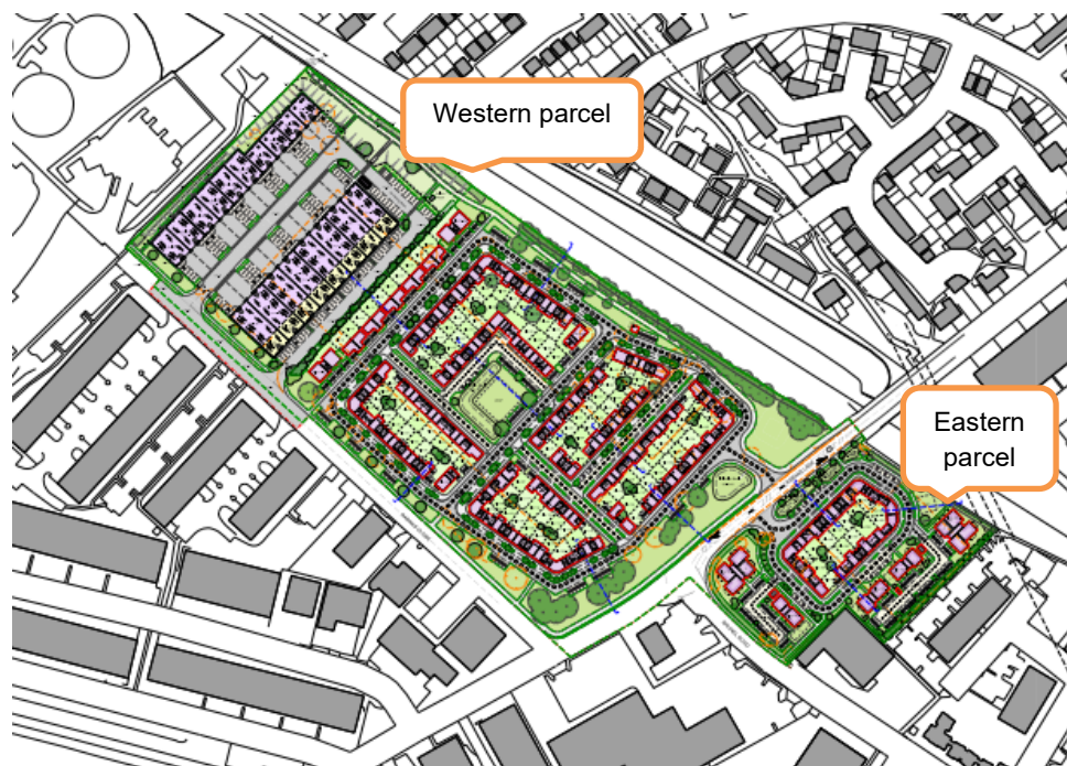
Figure 1.2 - Proposed site layout

which is to be accommodated on the larger western parcel of land. The justification for the proposed approach, which is not in conformity with policies D-AYL115, Rabans Lane either, is addressed in the following paragraphs.